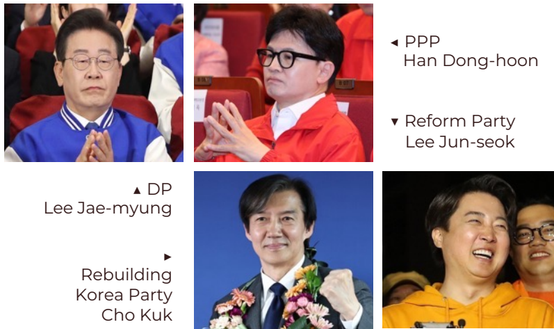
Figure 1 : Key figures during the election results announcement

Lee Jae-myung , the leader of the DP, was re-elected in Incheon's Gyeong district. The victory has enabled him to strengthen his influence within the DP, further consolidating his presidential ambitions. He is expected to exercise leadership in the upcoming NA as a prominent opposition candidate for the next presidential race. However, the DP will hold a convention to elect a new leader in August, leaving Lee the task of maintaining his profile as a presidential candidate even after stepping down from party leadership. It is speculated that he could therefore either run for the party leader once more or support a member in favour of his stance.